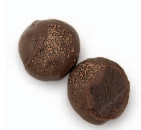
Pumpkin Pie Truffle #380100

fruity chardonnay ganache in dark chocolate, accented with grape colored sugar crystals.