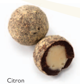
#343200 White chocolate ganache infused with vodka, natural lemon oil and lemon zest in dark chocolate dusted with lemon yellow powdered sugar.

Savor all four flavors of our vodka infused martini truffles in a lovely martini glass. See page 9 for ordering information.