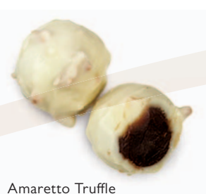
#390300 Almond milk chocolate ganache in white chocolate with crushed almonds.