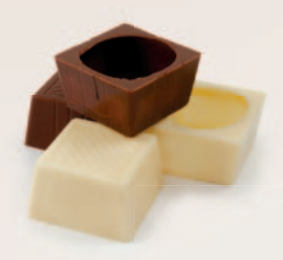
Square Praline Cup 26mm(I") × I5mm(%")