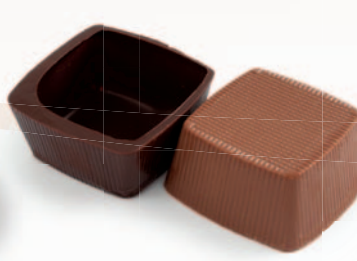
Mini Square Dessert Cup 48mm(| %")×22mm(%")