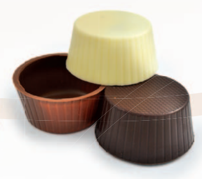
Deep Dish Dessert .68 \text{mm} (2.5\%) \times 31 \text{mm} (1.4\%)