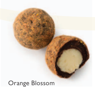
#344200 White chocolate ganache infused with vodka, laced with orange liqueur in dark chocolate dusted with orange powdered sugar.