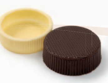
Mini Souffle Dessert Cup 50 \text{mm}(2") \times 16 \text{mm}(5\%")