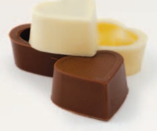
Heart Shell 32mm(1 1/4") × 16mm(5%")