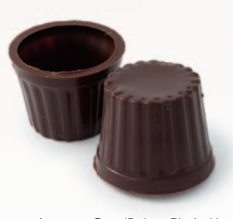
Liqueur Cup (Rahm Chubeli) 35mm(| 3/8") × 28mm(| 1/8")