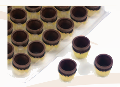
Liqueur Cup (Service Tray) 60 Gold foiled cups per tray. 35mm(| 3/8") × 28mm(| 1/8")