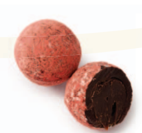
Raspberry Bouquet #345200 Dark chocolate ganache infused with vodka and natural raspberry flavor in dark chocolate with pink powdered sugar.