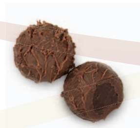
Milk Truffle #310100

Semisweet dark chocolate ganache in spiked dark chocolate.