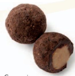
Cappuccino #347200 White chocolate ganache infused with vodka and coffee in dark chocolate dusted with cocoa powder laced with finely ground coffee and cinnamon.