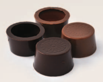
Praline Cup 30 \text{mm} (1 \frac{1}{8}) \times 16 \text{mm} (\frac{5}{8})