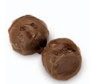
Cinnamon Truffle #312100 Cinnamon spiced milk ganache in milk chocolate

Dark chocolate infused with sweet and sour pomegranate juice in dark shell with crushed pomegranate seeds.