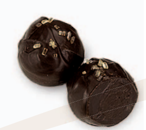
Rum Truffle #340200 Dark rum ganache in dark chocolate with brown sugar sprinkles.