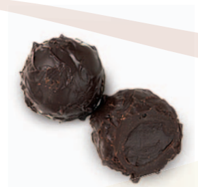
Dark Truffle #320200

Peach purée and white chocolate ganache in dark chocolate with white chocolate stripes.